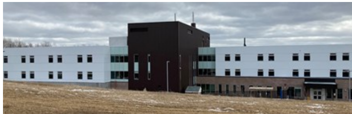
A community photo.

Construction has been completed on new 60-bed long-term care homes in Gander and Grand Falls-Windsor.